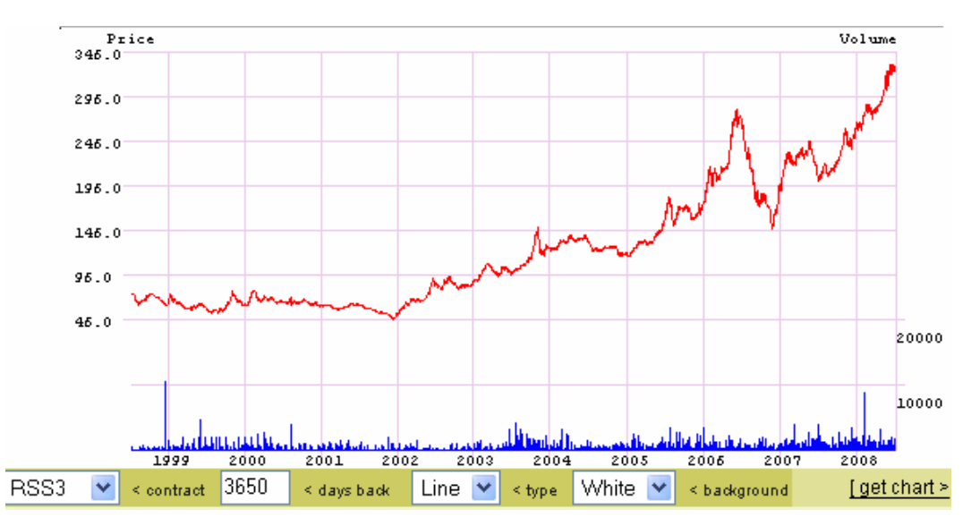
Figure 8: Ten year price chart for Natural Rubber (RSS3) in US$ per kg.

The current price increase of virtually all types of polymers, including natural rubber, means that for most rubber manufacturers, reprocessing rubber scrap is no longer an interesting alternative, but an economic necessity.